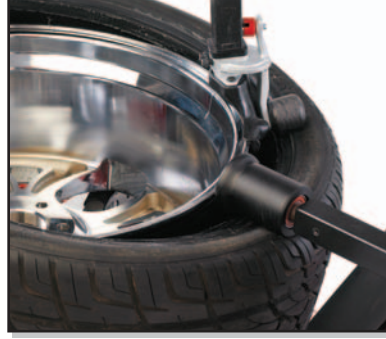
Horizontal Power Rollers