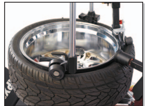
Four Power Helper Devices. Total Control.