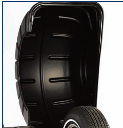
Auto Start Hood