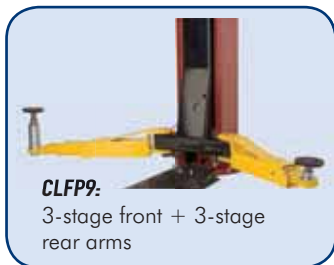
CLFP9: 3-stage front + 3-stage rear arms

The CLFP9 features a 10' 7/8" overall column height, making it ideal for low ceiling applications. Standard front and rear 3-stage arms provide maximum arm sweep, arm retraction and reach. CLFP9 will accommodate a wide variety of vehicle lifting points, including short and long wheelbase and wide body imports.